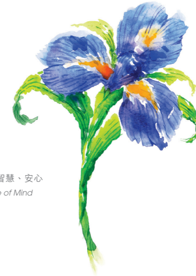
「愛麗絲」的花語：智慧、安心 Wisdom and Peace of Mind