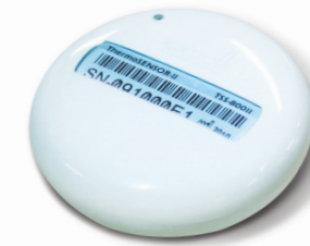
實物原大 Actual size